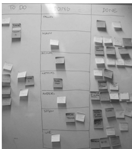
Figure 3. The Scrum board from one of the groups shows broken-down tasks and distribution of responsibility

The groups primarily implement the Daily Scrum meetings and the concept of breaking down tasks into small and manageable tasks, but also the Scrum board, which is often used as a visual planning tool, supporting the Scrum framework, is implemented as a central element in the project management routines. It is observed and to a large extent validated through the interviews that the groups using the Scrum practices are working more efficiently in one common direction and in general seems less stressed by the project. Figure 3 below shows how one of the project groups is using a Scrum board to support their internal communication and task management.