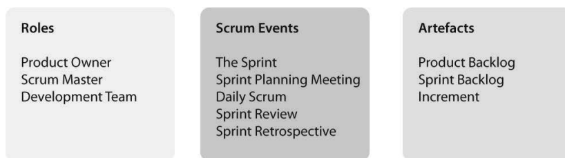
Figure 2. The roles, events and artefacts of Scrum

Ken Schwaber and Jeff Sutherland originally developed Scrum for software development, and throughout the last 10-15 years, it has evolved into a widely used framework in this industry. In the latest edition of the Scrum Guide [5], Scrum is described as interplay between a number of roles, artefacts and events, which are all subject to a set of rules and presented in Figure 2.