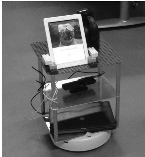
Figure 4. The coffee-serving robot Carlo