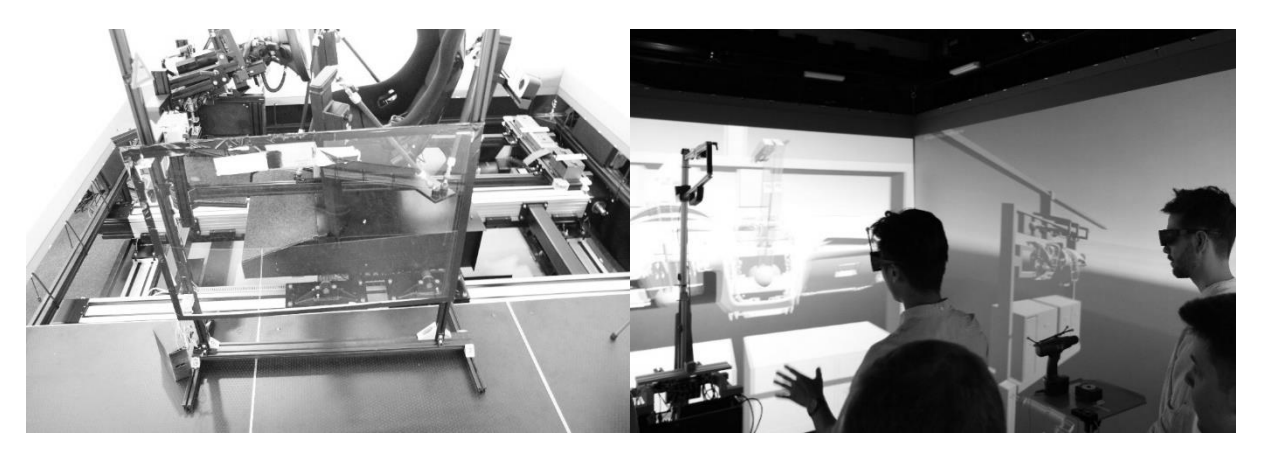
Figure 4. Hybrid Prototyping Device for Testing and Validation in Product Development (Left) and in Production Planning (Right)

This last stage of the project is covering the right branch of the V-Model and includes the development of a functional prototype and the integration of all models into a system level prototype. Starting off with completely virtual prototypes, that were created within initial design phase, these were more and more enhanced by physical elements, to be able to also test the corresponding human-machine interaction. The integration phase was successfully finished by ending up with hybrid and also physical parts, that resemble the actual behaviour of the final product and production system. The robustness of the created prototypes was checked along the provided test and verification plan. To conclude and summarise the entire development process the student teams needed to present the results to the customer within the final presentation.