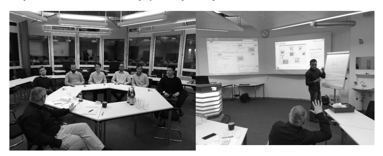
Figure 3. Design review in education classes

How does the system work? How is the system validated? Does the system meet all requirements? The demonstration part consists of the tests for the created prototypes in real-time environment. Two examples of prototypes are shown in figure 4. With the help of a group of tests, the team describes the most important function of the product. For this they can use Functional Digital Mock Up (FDMU), Model-in-the-Loop (MiL) or co-simulation methods. Based on the results of the final presentation the companies' customer reflects which project was providing the most added values.